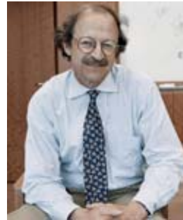
Nobelist Harold Varmus

Nuclear fission was a mere eight months old when the Panzers rolled into Poland in September 1939, beginning the Second World War. Niels Bohr had announced the discovery at a conference on theoretical physics at George Washington University. Three years later the crash program to build an atomic device from a uranium isotope began in earnest. And within three years of that—Aug. 6, 1945—a bomb named Little Boy exploded over Hiroshima.